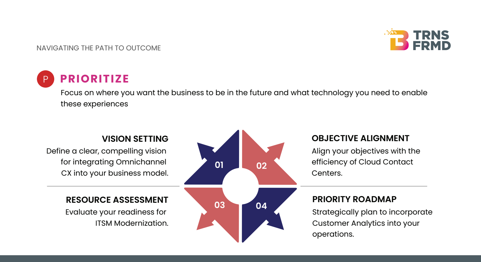
Success Story : Leading financial services company struggled with low customer satisfaction due to disjointed customer service channels. We prioritized an Omnichannel CX strategy to unify customer interactions.

Outcomes: - 3 new digital channels added for enhanced customer interaction.